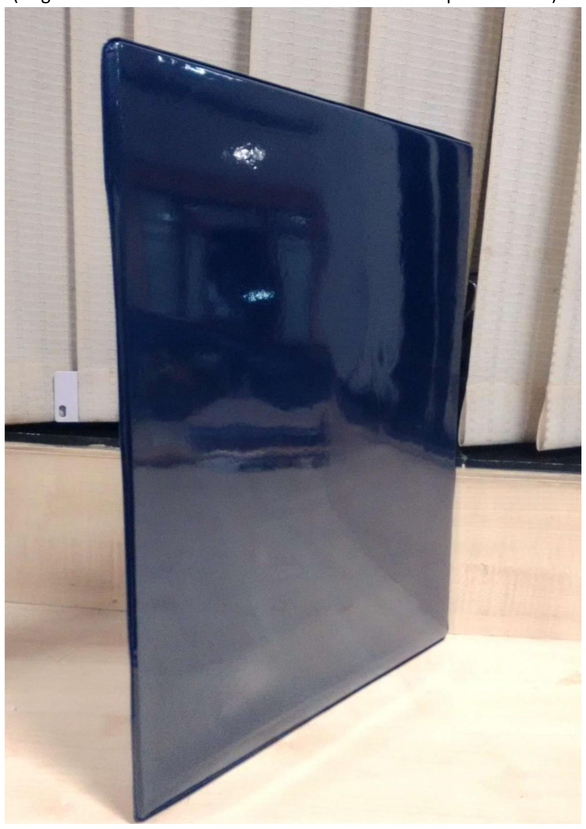
Size: 31.5 cm (Width), 44.5cm (Height)