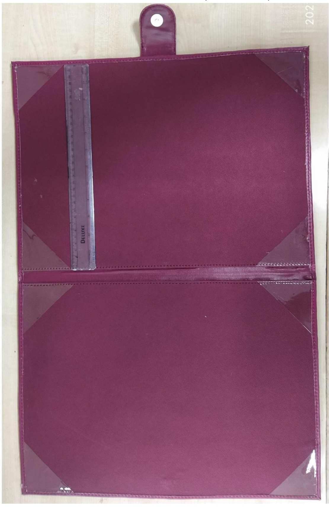
Inner-view of A3 size Certificate Folder (Double-Sided):