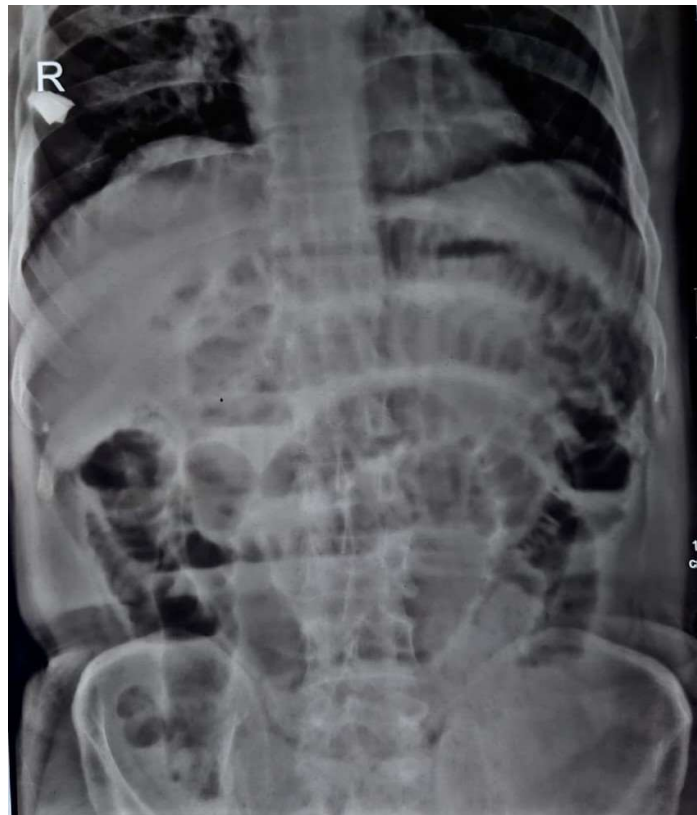
Figure 1. X Ray abdomen showing dilated intestinal loops.

emergent exploratory laparotomy through a midline incision. Dilated loops of the ileum were seen with mild free fluid. On tracing the small intestine, a foreign body of 10cm in length and 6 cm in width was felt approximately 20 cm from the ileocecal valve. The distal bowel collapsed, a longitudinal enterotomy was done and the foreign body was extracted which turned out to be a mango seed (Figure 2). The bowel decompression was done, and a temporary loop ileostomy was done (Figure 3). The patient had an uneventful postoperative course and was discharged in stable condition on the 7 th postoperative day. Stoma bag care was taught to the patient and his relatives with advice to follow up after 6 weeks (Figure 4).