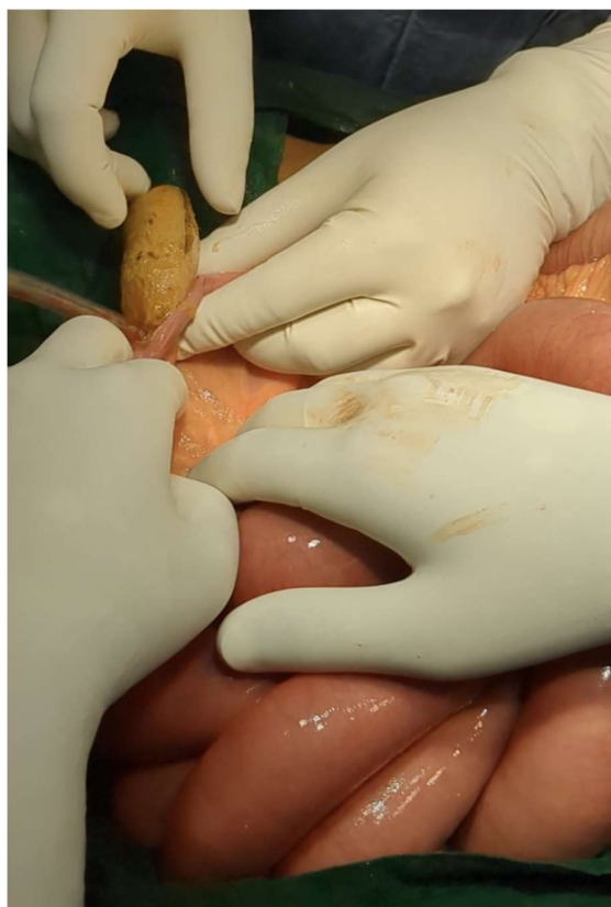
Figure 2. Mango seed getting extracted through enterotomy.