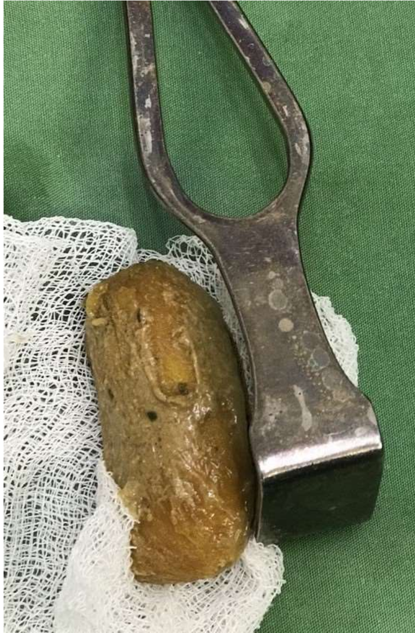
Figure 4. The phytobezoar mango seed 10 cm in length and 6 cm in breadth.