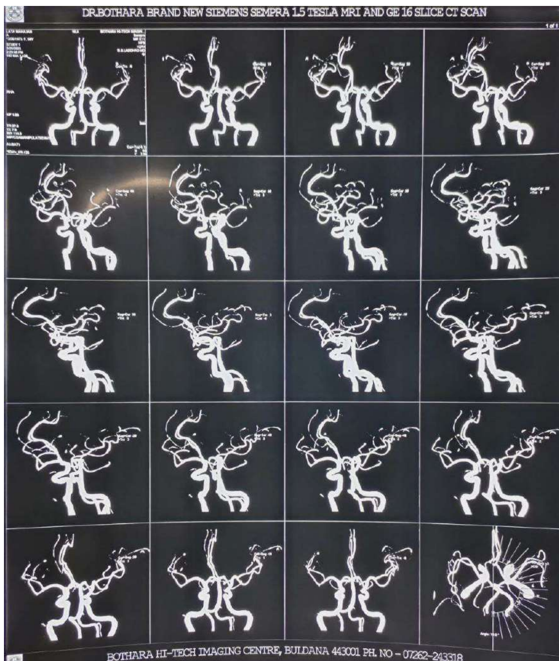
Figure 4. MR venogram.