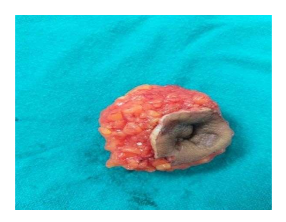
Figure 1. Excised Specimen