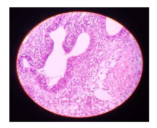
Figure 2. Histopathology images showing endometrial like glands and endometrial stroma