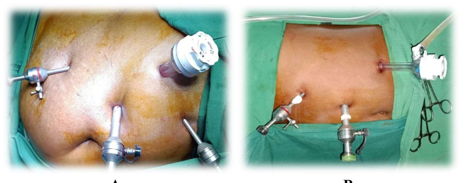
A B Figure 1. Port placement for procedures - A: Right side, B: Left side

For laparoscopic partial nephrectomy, after releasing the renal artery and vein, Gerota's fascia was opened, and the renal mass was identified. The boundary between the mass and normal renal parenchyma was determined, and the renal artery was clamped to achieve warm ischemia. The mass was removed using cold scissors, and the collecting system and bleeding areas were sutured. Surgicell cushions were placed, and the renal parenchyma was closed. The specimen was removed through a separate incision.