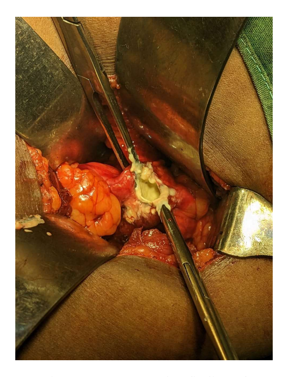
Figure 2- Intraoperative finding of dermoid cyst retroperitoneum

right erector spinae muscle in the retroperitoneum (Figure 3). The patient underwent excision of the hydatid cyst with the extraperitoneal approach with a smooth postoperative recovery.