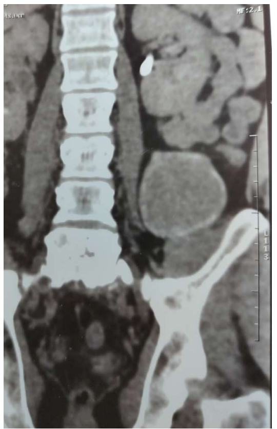
Figure 1. CT scan showing suspected dermoid cyst attached to the left psoas muscle.

provisional diagnosis of hydatid cyst was made, and the patient was posted for surgery (Figure 1). On performing a laparotomy through a left lumbar extraperitoneal approach, a 6cmX8cm dermoid cyst seen attached with the L3 and L4 vertebra. The cyst contained cheesy material with hairs. Excision of the entire cyst done, and the cyst wall was sent for histopathology (Figure 2).