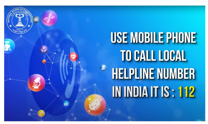
Figure 4. If no one is available, use your mobile phone to call the local helpline number (in India it is 112) and activate the emergency response system.