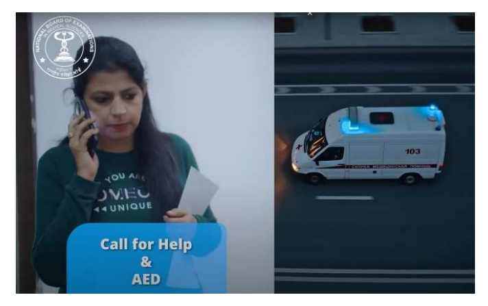
Figure 3. Ask the nearby person to get the emergency kit, automated external defibrillator (AED) and activate emergency.