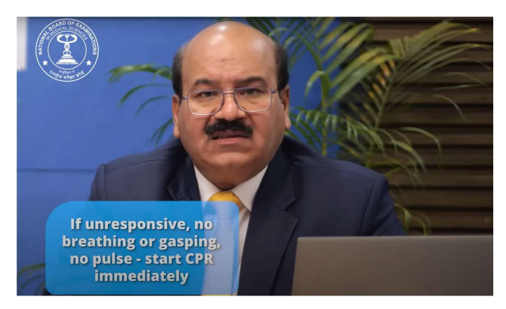
Figure 6. If unresponsive, no breathing or gasping, no pulse, start the CPR immediately.