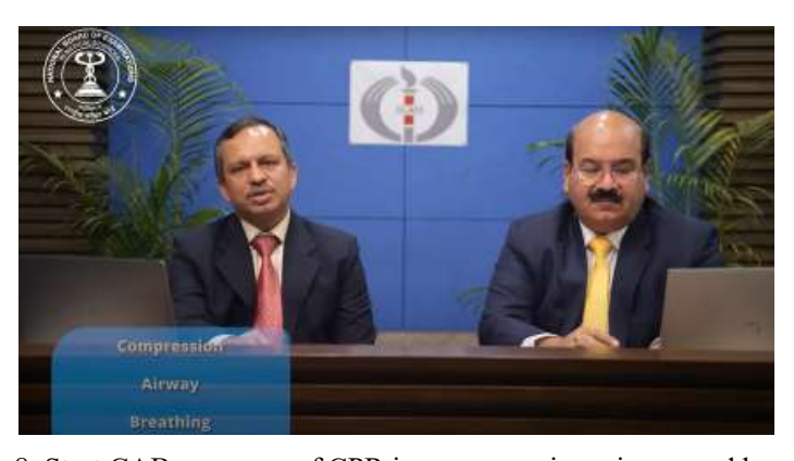
Figure 8. Start CAB sequence of CPR i.e. compression, airway and breathing.