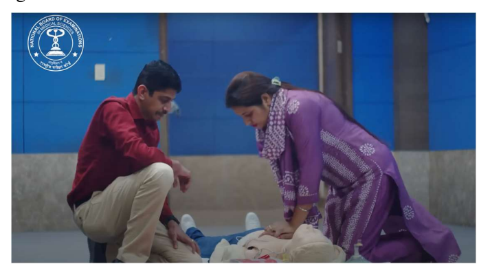
Figure 18. AED operation have two steps, first step is switching on the AED and second is to follow the voice command. The rescuer continued the cardiac compression and operation of AED.