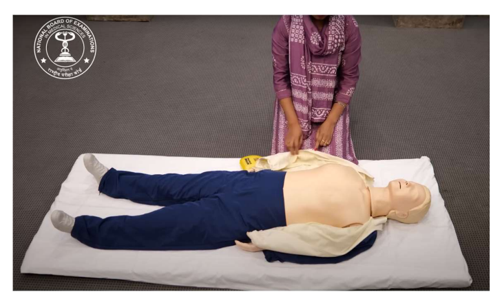
Figure 7: Ensure the person is lying on hard surface, remove the cloths from the chest.