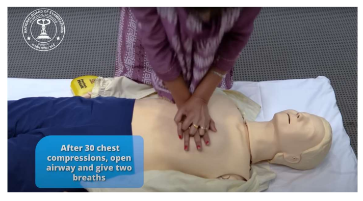
Figure 14. After 30 chest compression, open airway and give two breath