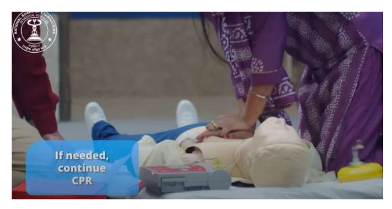
Figure 21. If needed, continue CPR without removing the AED pads just turn it off.