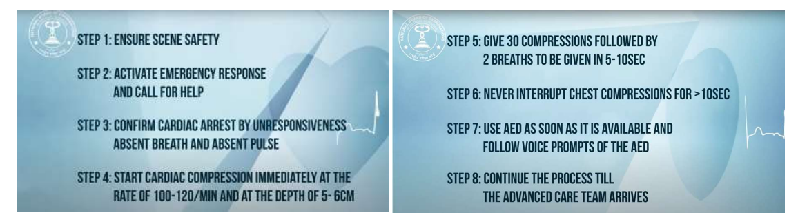
Figure 23. Summary of CPR – In eight steps