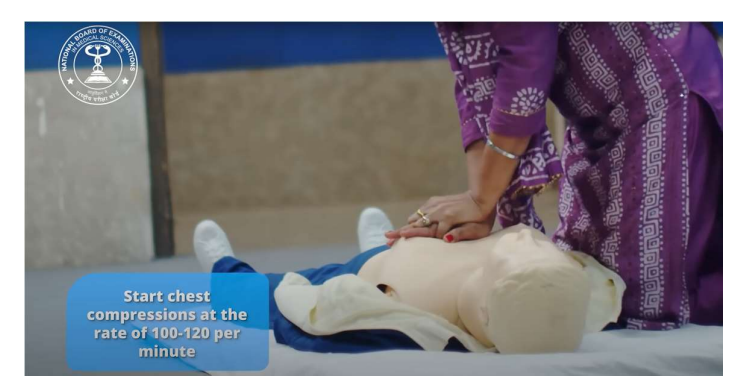
Figure 13. Start chest compressions at the rate of 100-120 per minute