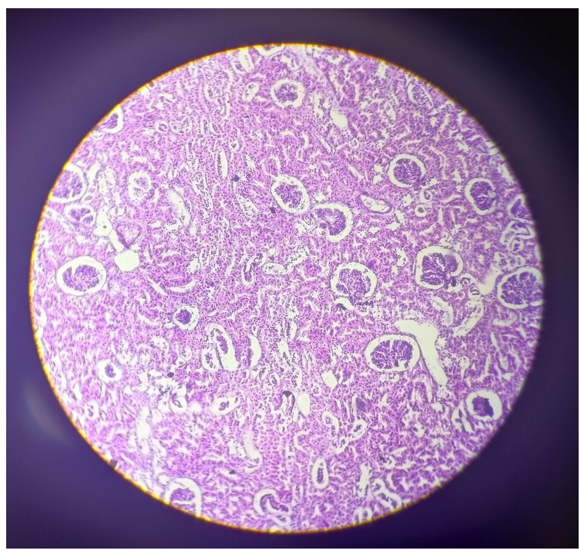
Figure 2. Histopathological examination of Kidney (Photomicrograph), H & E, Scanner View, within normal limits.